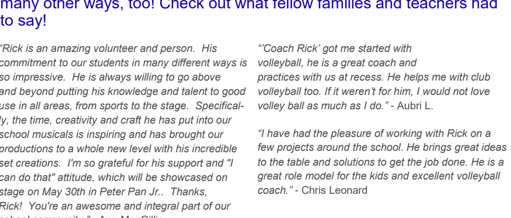
*Our Teacher/Staff Appreciation Spotlight will be back next week!